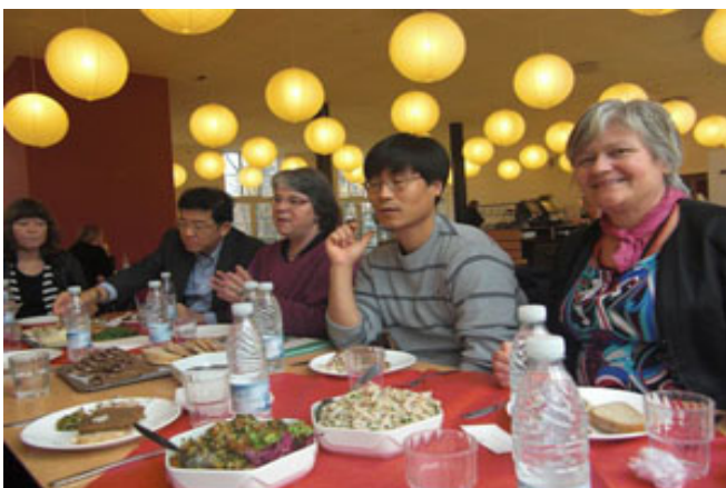
To the left: The network meeting at Danish School of Education, Aarhus University, Copenhagen, March 2009.