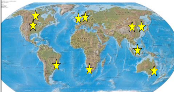
International Alliance of Leading Education Institutes