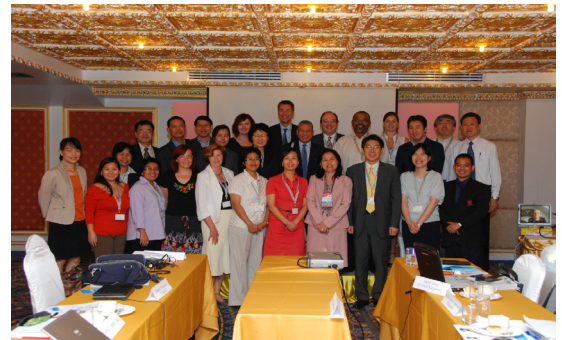
ASEM LLL Research Network 1 Preparatory Meeting for the White Paper on e-learning project in July 2009, Bangkok, Thailand.

The book focuses on the main question “ how does e-learning contribute to lifelong learning? ” and aims to create a reference framework for policy development at national and regional level. This project also created opportunity for each participating university to systematically review their national policy and practices in e-learning in lifelong learning.