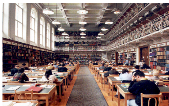
Innsbruck University Library

Visit the University of Innsbruck Homepage for further information www.uibk.ac.at