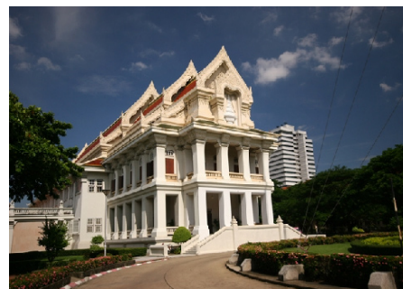
Chulalongkorn University, Bangkok, Thailand

Chulalongkorn University faculty and researchers conduct over 1000 studies annually. The results are published for both national and international audiences. In 2006, 897 studies were published in international journals while 848 were published in national journals.