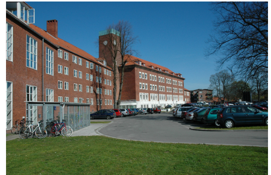
Danish School of Education, Copenhagen, Denmark

Aarhus University is placed in the top 100 of the world's universities – as no. 63 in the Times Higher Education rankings and no. 93 in the Shanghai Jaotong List. The university has nine faculties of which the Danish School of Education (DPU) is one. DPU employs approximately 200 researchers in permanent positions and others on research contracts. Approximately 4,000 students are enrolled on twenty postgraduate programmes with a further 100 enrolled as PhD students, making the Danish School of Education one of the largest in Europe within its field.