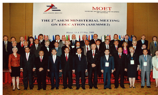
The 2nd ASEM Education Ministers Meeting in May 2009, Hanoi, Vietnam.