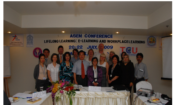
ASEM LLL Research Network 2 Preparatory Meeting for the Asia-Europe Workplace Learning Survey in July 2009, Bangkok, Thailand.